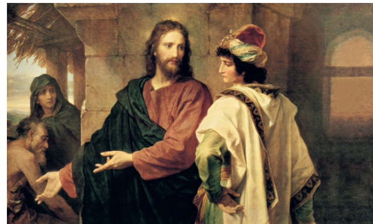
Heinrich Hofmann, "Christ and the Rich Young Ruler "

Peter began to say to him, 'Look, we have left everything and followed you.' Jesus said, 'Truly I tell you there is no one who has left house or brothers or sisters or mother or father or children or fields, for my sake and for the sake of the good news, who will not receive a hundredfold now in this age – houses, brothers and sisters, mothers and children, and fields – but with persecutions – and in the age to come eternal life. But many who are first will be last, and the last will be first.'